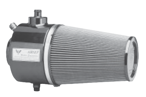
Airsep offers units that bolt directly to the engine air intake, filtering air, coalescing oil, and reducing noise.

The units are claimed to reduce intake and turbo noise by as much as 6-10 dBa.