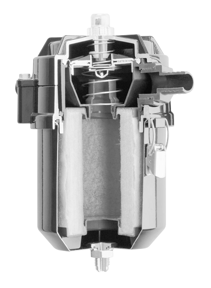
Racor's CCV line is a remotely mounted closed system incorporating a drain cock for coalesced oil.

include some or all of the following: several feet of inlet hose, check valves, an air box drain collector, the coalescing filter unit, several feet of outlet hose, a vacuum regulator (may be integral to the filter unit), a tap sleeve or air filter connector, air filter unit, mounting brackets, and hose clamps. Both companies provide detailed installation instructions.